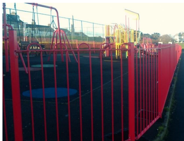
Seafront Play Park

Unlike the play area near the tennis courts in Main Street, this park is not fenced off and there is nothing to prevent children running out into the car park immediately adjacent to it. Parents and those looking after children need to be reassured that the children are safe. Surely it would not take too much to put up a fence to act as a protection? GVA has contacted the Council about getting a fence around the play area.