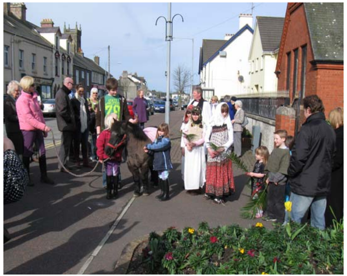
Outside the Parish Halls the children take delight in greeting the pony.